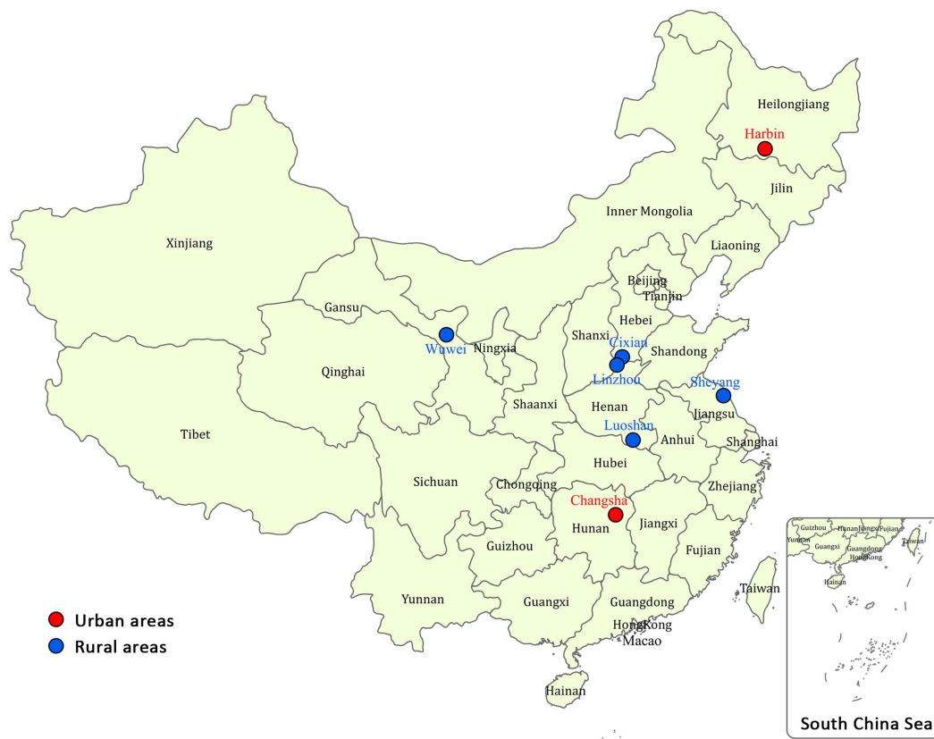
Figure 1 Geographic distribution of seven study sites.

direct non-medical cost and annual indirect cost, we sampled the former patients of the seven hospitals discharged before 1st September 2015 diagnosed as stomach cancer or esophageal cancer. Patients with both cancers were excluded. We chose approximately 150 patients for each cancer in each area. Balance of sex and clinical stage were considered in the selection to ensure that the numbers of stage I to IV patients were not less than 30 in each area. Patients were selected backwardly based on the discharge date in the electronic medical record until the expected sample size was reached. Besides demographic information, we also collected ID number, discharge diagnosis, LOS, clinical stage, pathologic type, primary treatment, the number of hospitalization in the past year, direct non-medical cost (nutraceutical fee and commission to caregivers) and indirect cost (productivity loss of the patients and their family members) in the past year.